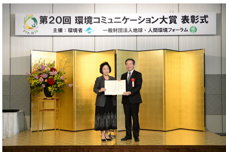
Awards ceremony on February 22, 2017

Sompo Holdings will continue to proactively disclose information and engage in dialogue with stakeholders, contributing to creating a sustainable society.