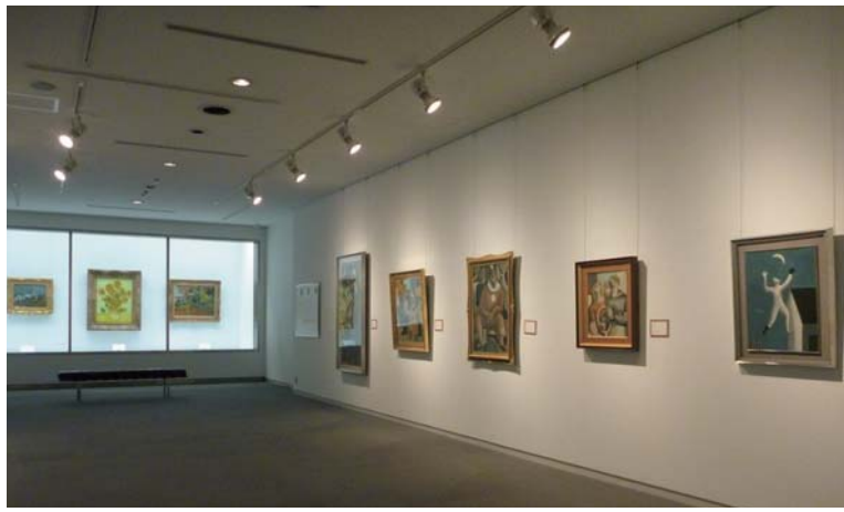
Upper: Art appreciation through dialogue Lower: The Seiji Togo Memorial Sompo Japan Nipponkoa Museum of Art * The museum is operated by Sompo Japan Nipponkoa Fine Art Foundation