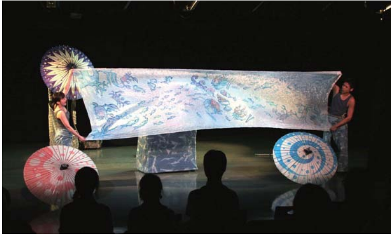
Upper: Puppet mini caravan visiting children's ward Lower: Show given by Puppet Theater Yumemi Trunk