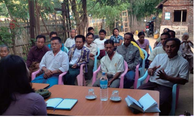
Upper: Presentation for Thai farmers on procedures for insurance payment Lower: Hearing survey in Myanmar