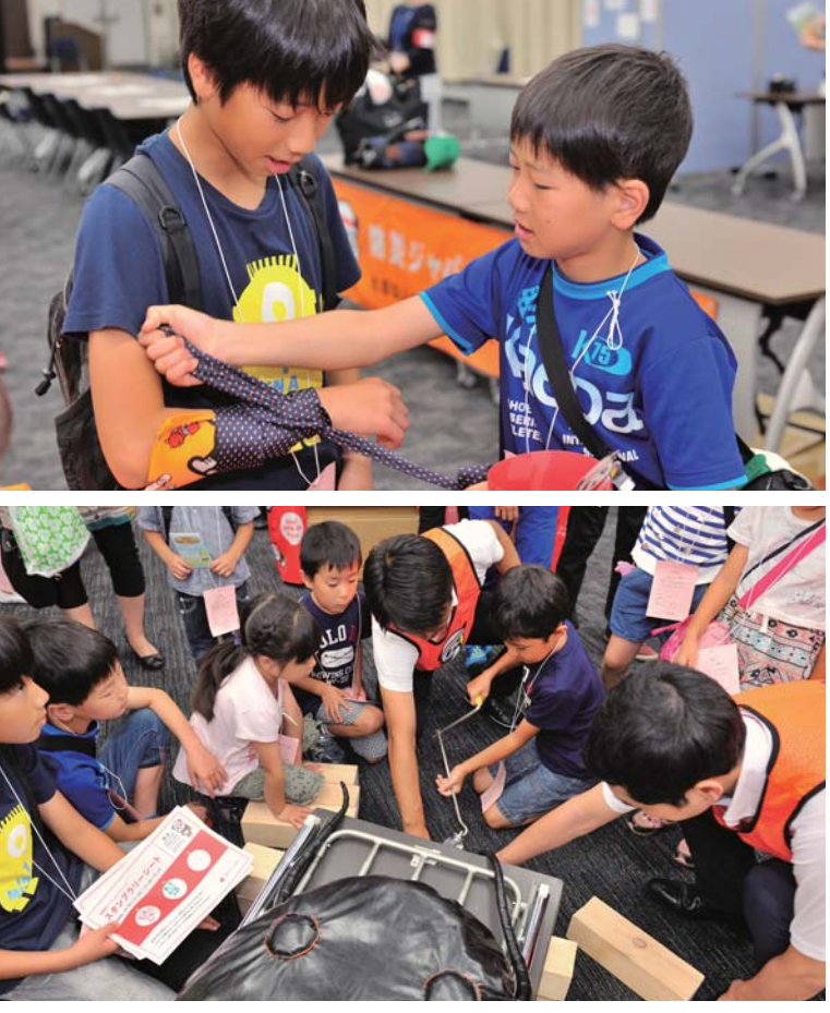
Experienced-based workshop, provided in partnership with NPO Plus Arts Upper: First-aid in emergency workshop Lower: Jack-up game

As part of Community Contribution Project, these projects are funded from cost savings achieved when customers sign up for the "web-based insurance clause" option for car insurance, or actually use recycled parts for vehicle repairs in case of an accident.