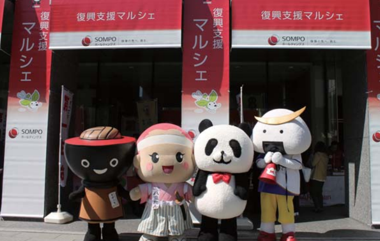
Upper: Employee dispatch program at Ishinomaki City in Miyagi Lower: Farmers Market Supporting Disaster Recovery