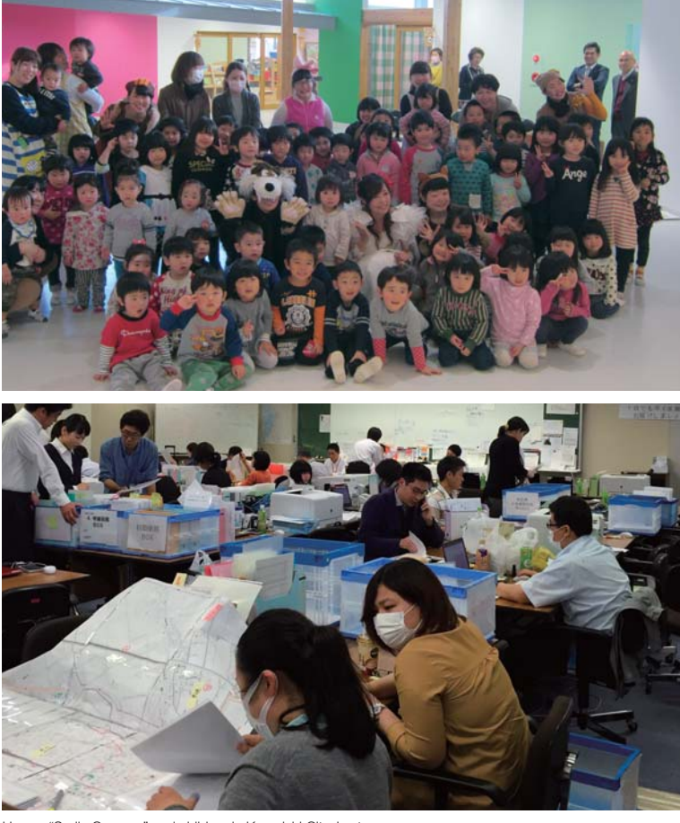
Upper: "Smile Caravan" and children in Kamaishi City, Iwate Lower: Emergency response headquarters after the Kumamoto Earthquake