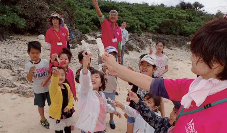
Upper: Nature conservation event in Hachirogata, Akita Lower: Searching coral reef in Okinawa