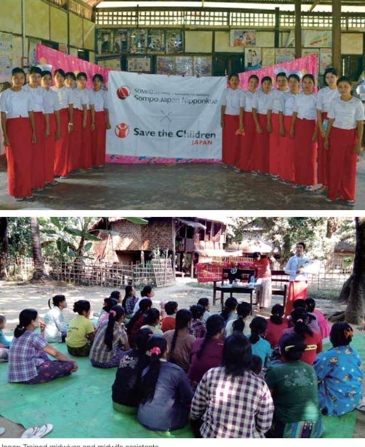
Upper: Trained midwives and midwife assistants Lower: Visitation of health center by citizens