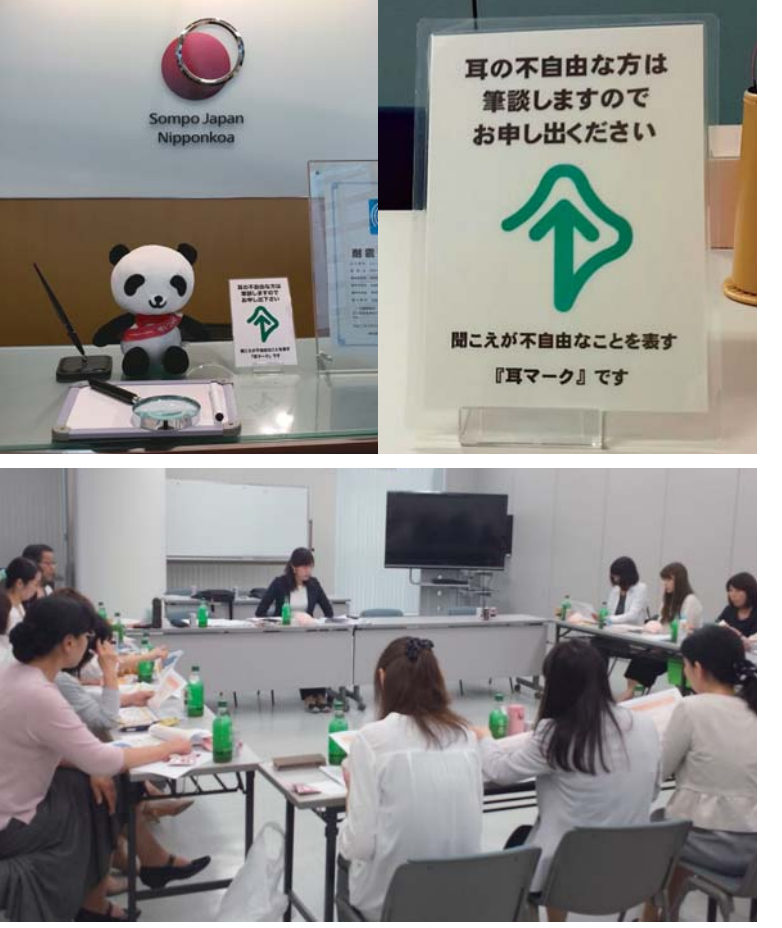
Upper: Sign showing hearing disability assistance posted at one of several office building locations Lower: Training for employees and agencies

(Sompo Japan Nipponkoa Himawari Life) * Source: The 2015 LGBT Survey by Dentsu Diversity Lab.