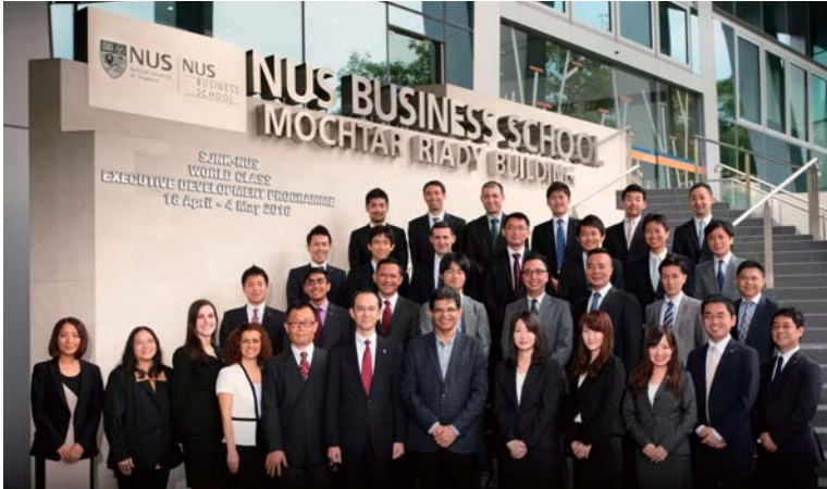
Upper: Holding annual Global Diversity Meeting to promote communication within employees Lower: SOMPO Global University program provided in cooperation with the National University of Singapore's Business School