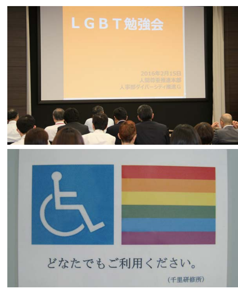
Upper: LGBT Seminar Lower: LGBT's rainbow colour at the toilet of training center