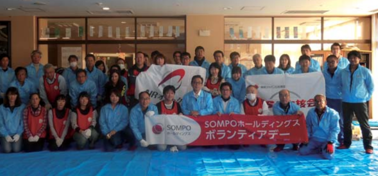
Upper: Activities at Kusunoki (social welfare corporation) in Kanagawa Lower: Activities at Takada jikouin (social welfare corporation) in Mie