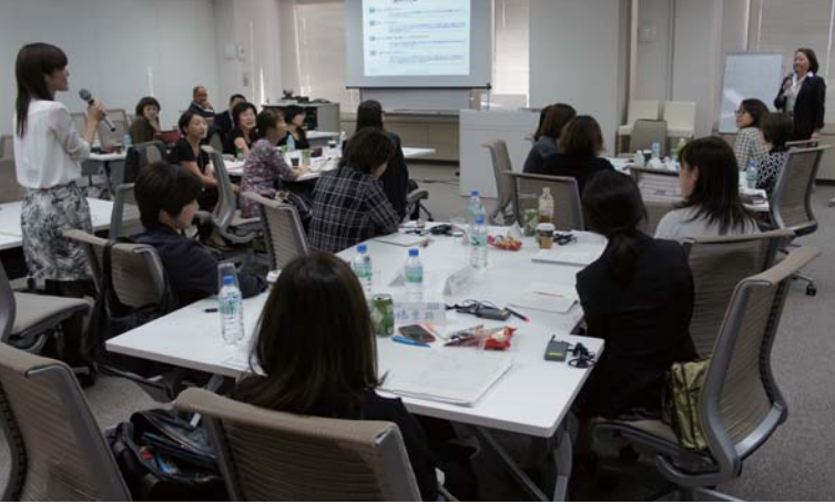
Upper: Childcare Leave Forum Lower: Pan-industry social event