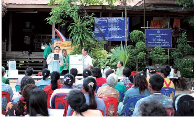
Explanation of products to Thai farmers