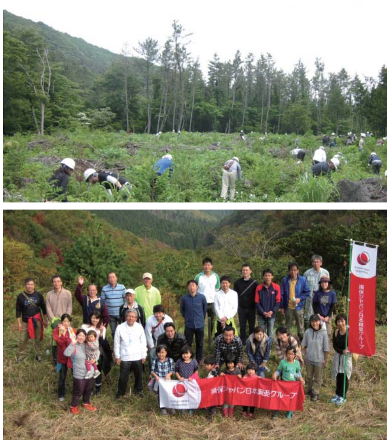
Upper: Activities in the Akagi forest in Gunma Lower: Activities in the Tottori Kyosei no Mori forest