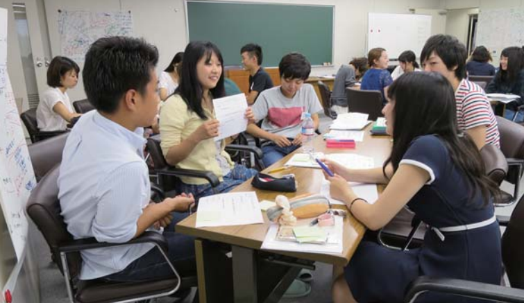
Upper: Public Seminars on the Environment, an outdoor class to experience nature through eating Lower: CSO Learning Scholarship Program: Training session