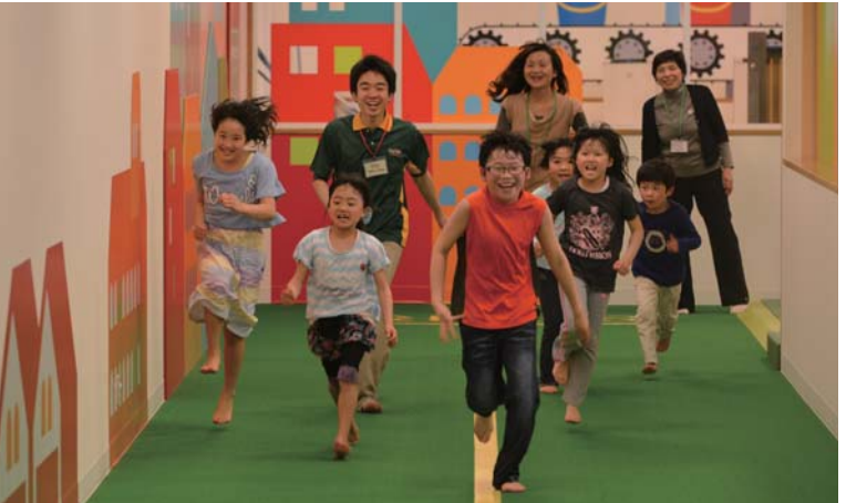
Upper: Donating to promote barrier-free access to rural market in Thailand Lower: Operation support for parks and healthcare of children in Fukushima, Japan