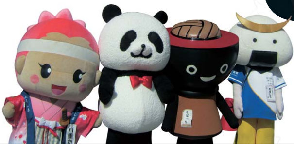
◀ Mascot characters (from the left): Yaetan (Fukushima), JAPAN-DA, Sobatchi (Iwate) and Musubimaru (Miyagi)