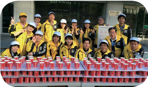
▲ Volunteers of the Fourth Osaka Marathon in Osaka

The SOMPO HOLDINGS Volunteer Days, a group-wide initiative, has been held since 2011. Over 10,000 employees participate in volunteer programs every year in a range of fields including disaster recovery, international cooperation, the environment, and social welfare.