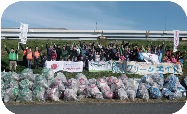
▲ Biodiversity conservation activities at Arakawa River in Tokyo