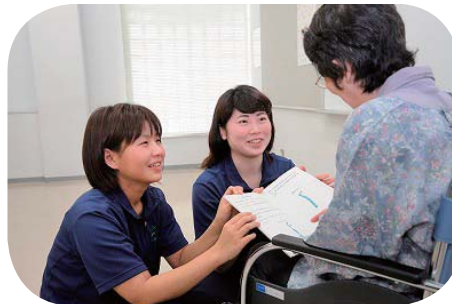
▲ Scholarships for future licensed nursing care workers (care giving practice)

Sompo Japan Nipponkoa Welfare Foundation, established in 1977, provides financial support to NGOs, NPOs and other organizations that play a leading role in the field of social welfare in Japan and abroad. The foundation offers psychological and technical support to families caring for elderlies at home, and provides scholarships to students studying to be licensed nursing care worker. The foundation also sets study groups on social welfare, social security, insurance, and gerontology, provides grants for research, and implements the Sompo Japan Nipponkoa Foundation Award program. We strive to implement programs that benefits social welfare improvement while meeting today's demands in academia and society.