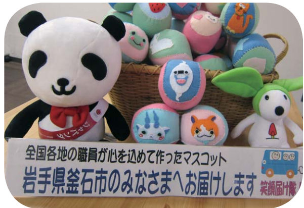
▲ Handmade balls as a gift from employee volunteers

We own Himawari Hall (Sunflower Hall), a puppet theater, in the Nagoya Building in Aichi, Japan since 1989, and have been striving to give back to communities with the Aichi Puppetry Center, a local NPO that operates the hall. A traveling puppet troupe was formed with an aim of providing psychological support for children and of revitalizing local communities after 2011 earthquake and tsunami. We continue to hold puppet shows at local child rearing support centers and kindergartens in Kamaishi, Iwate.