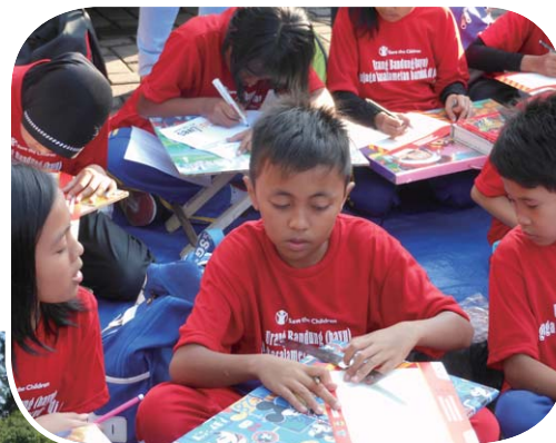
Road safety event in Indonesia

We launched a road safety project in Bandung, Indonesia, with an aim of creating a safer environment for children. Drawing on Japan's expertise in preventing traffic accidents, we are providing traffic safety education for teachers and students at elementary and middle schools, improving transportation infrastructure near the schools, and seeking actions from regional and national governments.