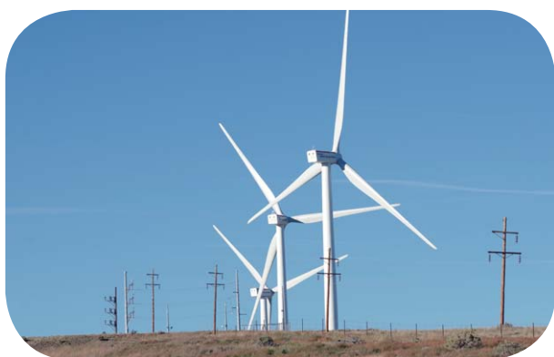
This insurance product received Japan's Environmental Minister's Prize, under the Eco-Services Category of the Eleventh Eco-Products Awards.

We sell an insurance with a rider to cover the costs to prevent recurrence of accidents (i.e., cost for investigating the cause of the accident and for inspection to prevent recurrence) in addition to ordinary claim payment in case of incidences such as fire, lightning, and wind damage.