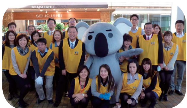
▲ Cleaning activity (Sonpo 24)