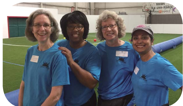
▲ Volunteers for organizing a charity dodge ball tournament (Sompo Japan Nipponkoa America Insurance Services)