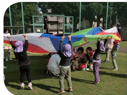
▲ Enjoying exercise in a large park