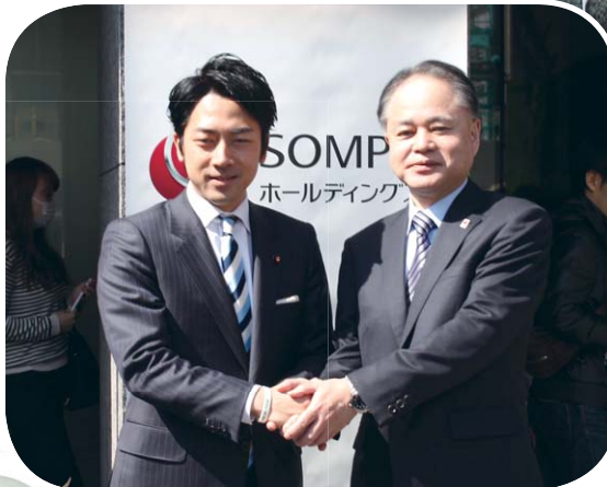
◀ Receiving Shinjiro Koizumi, Parliamentary Vice-Minister for Reconstruction.