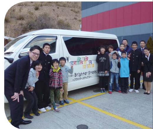
▲ Presentation ceremony in Nagasaki: Supporting the cost to purchase an automobile