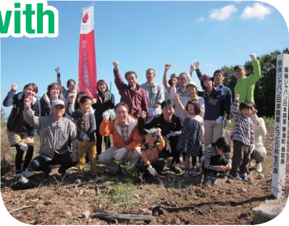
▲ Activities in the Tottori Kyosei no Mori forest

▼ An outdoor class to experience nature through eating