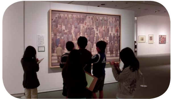
▲ Art appreciation through dialogue for elementary and junior high school students in Shinjuku, Tokyo

▲ As a disaster recovery assistance project for Tohoku, Japan, we co-sponsored a special exhibition of Vincent van Gogh's Sunflowers at the Miyagi Museum of Art from July 15 to August 31, 2014.