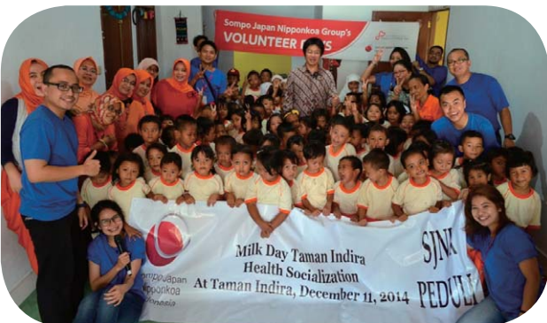
▲ Health education and donation for children (PT. Asuransi Sompo Japan Nipponkoa Indonesia)