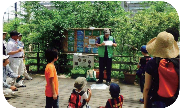
▲ Nurturing satoyama in Yamanashi as a habitat of the great purple emperor, the national butterfly

This project serves as one of Community Contribution Projects, and is funded by a portion of money saved when insurance customers select the paperless option for receiving their insurance clause, or when they use recycled parts to repair their vehicles after automobile accidents.