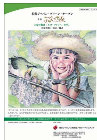
Sompo Japan Green Open's brochure