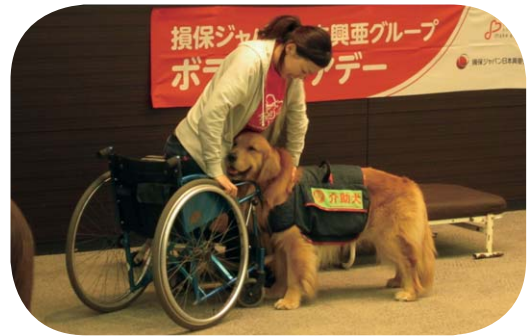
▲ Demonstration of a service dog in Tokyo