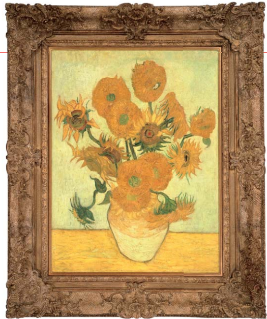
Sunflowers , 1888, Vincent van Gogh

Collaboration with the production of Detective Conan: Sunflowers of Inferno , a popular animation movie opened to the public in April 2015.