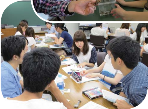
▲ Training camp

Sampo Japan Nipponkoa Environment Foundation launched the CSO (Civil Society Organization) Learning Scholarship Program in fiscal 2000. Every year, around 60 undergraduate and graduate students work at environmental NGOs and NPOs with their staff members over a period of eight months. The Program provides a unique opportunity for students to learn about environmental issues and civil society. The total number of students who completed the internship since the launch of the program is 843 as of March 31, 2015.