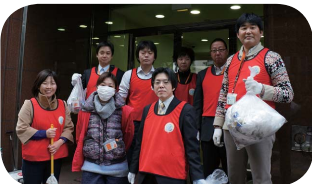
▲ Cleaning activity (Saison Automobile and Fire)