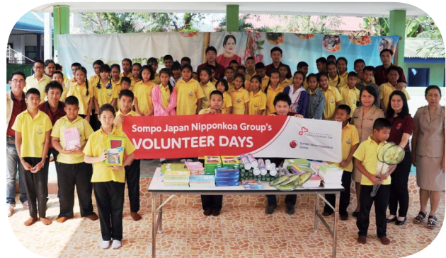
▲ Donation of sports equipment and other goods to an elementary school (Sompo Japan Nipponkoa Insurance (Thailand))