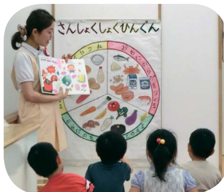
▲ Dietary education using picture books and diagrams

Sompo Japan Nipponkoa Smile Kids Foundation operates an authorized nursery school, the Sompo Japan Nipponkoa Smile Kids Edogawabashi Nursery School in Bunkyo, Tokyo. The nursery school accommodates around 60 children from 43-day-old infants up to pre-schoolers, whose parents are both working and residing in Bunkyo. On sunny days, children enjoy walks through local green areas and take parts in seasonal events including sports events and outings.