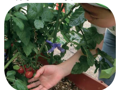
▲ Harvesting cherry tomatoes ▲ Helping to sell cookies made by people with disabilities