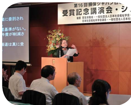
▲ Lecture at the Sompo Japan Nipponkoa Welfare Foundation Award Ceremony