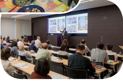
▲ Public Seminar

We have been hosting public seminars on the environment every year since 1993, as joint project of Sampo Japan Nipponkoa, Sampo Japan Nipponkoa Environment Foundation and Japan Environmental Education Forum. The total number of participants reached 18,000 in 2014, the 22nd year of the program.