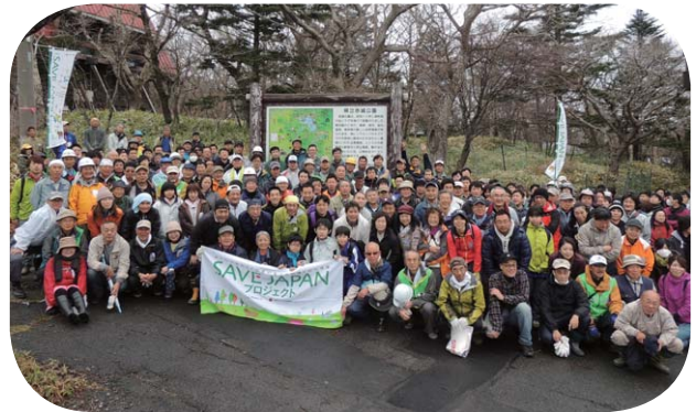
▲ Restoring Kakumanbuchi in Gunma as a habitat for Japanese azalea and day lily