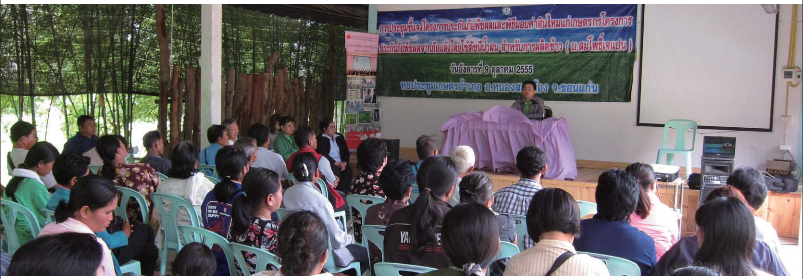
▲ Presentation for Thai farmers on procedures for insurance payment