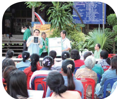
▲ Explanation of products to Thai farmers