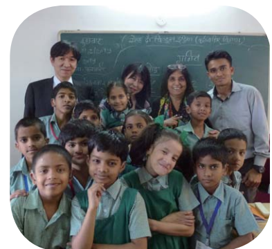
▲ Presentation ceremony in India