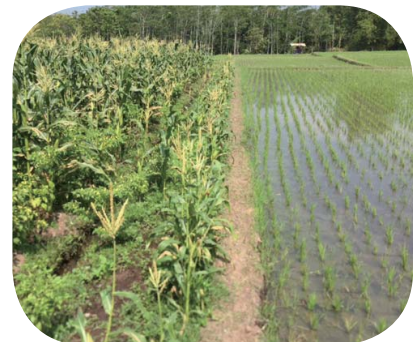
▲ Farm scenery in Indonesia