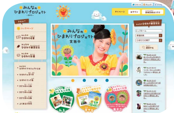
◀ Special website on Everyone's Sunflowers Project (Sompo Japan Nipponkoa Himawari Life)