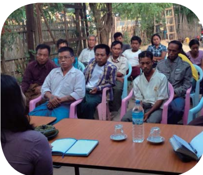
▲ Hearing survey in Myanmar