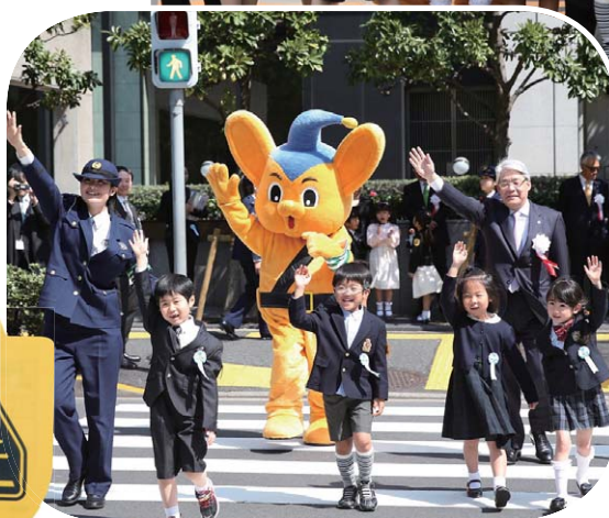
▲ First graders with their yellow badge