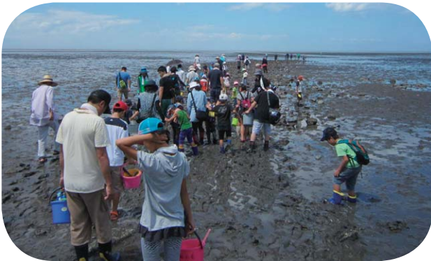
▲ Studying living creatures at Nakatsu tidal flat in Oita