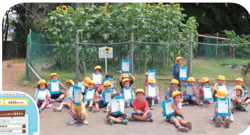
▲ A class on Everyone's Sunflowers Project

This project provides an opportunity for children to share the joy of growing sunflowers from seed to see them bloom, and to learn the value of life in school classes. The project has been implemented since 2012, hoping that it will make children happier and keep them smiling.