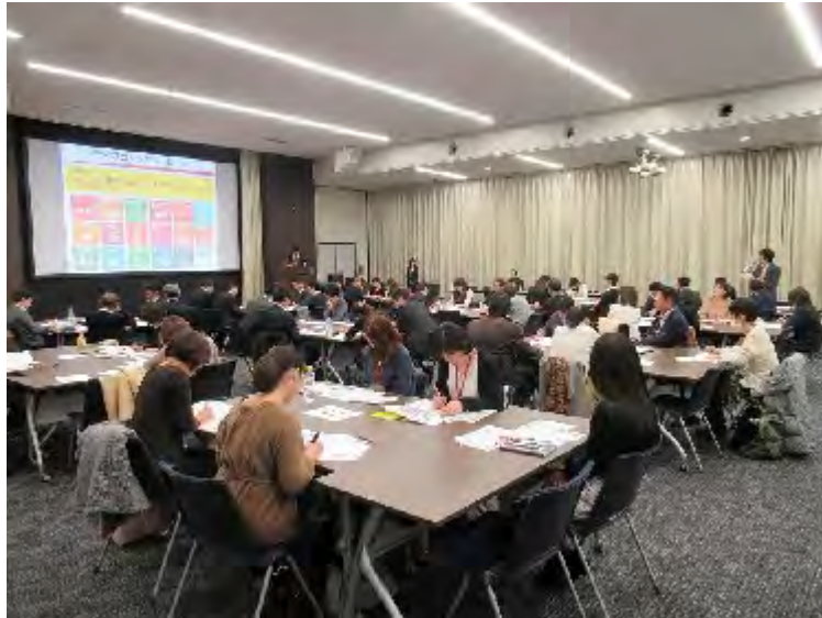
CSR Development Seminar