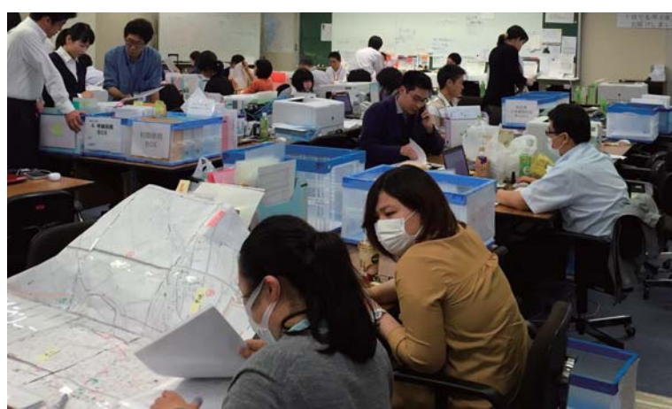
Upper: Employee dispatch program at Ishinomaki City in Miyagi Lower: Farmers Market Supporting Disaster Recovery