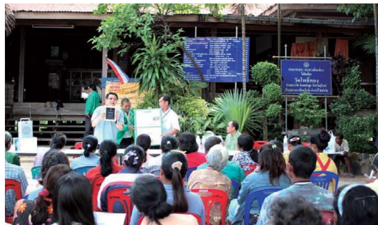
Upper: Presentation for Thai farmers on procedures for insurance payment Lower: Hearing survey in Myanmar