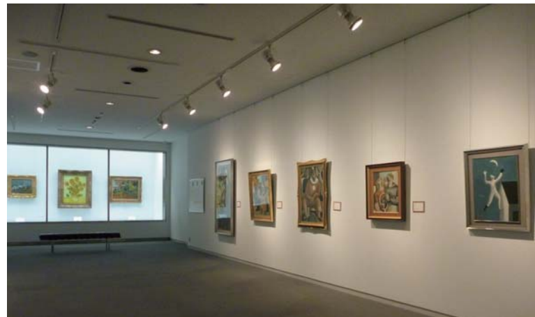
Upper: Art appreciation through dialogue Lower: The Seiji Togo Memorial Sompo Japan Nipponkoa Museum of Art * The museum is operated by Sompo Japan Nipponkoa Fine Art Foundation