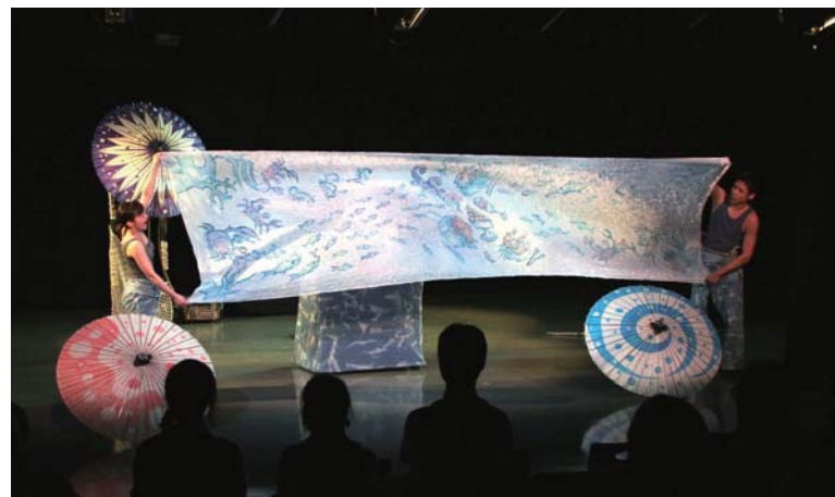
Upper: Puppet mini caravan visiting children's ward Lower: Show given by Puppet Theater Yumemi Trunk