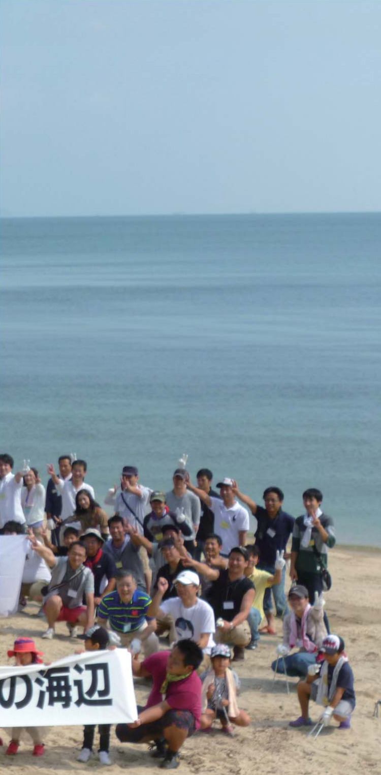
▲ Eighth cleanup activity at Seto Inland Sea in Kagawa, Japan

The CSR Booklet shows examples of our CSR initiatives in a simple and understandable manner.