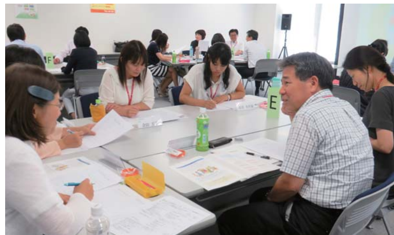
Upper: Training program in the Sompo Holdings Volunteer Days Lower: Training for dementia supporters (Sompo Japan Nipponkoa Insurance Services)