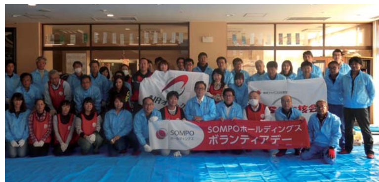
Upper: Activities at Kusunoki (social welfare corporation) in Kanagawa Lower: Activities at Takada jikouin (social welfare corporation) in Mie