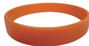
Putting "Orange Ring" as a mark for supporting dementia.