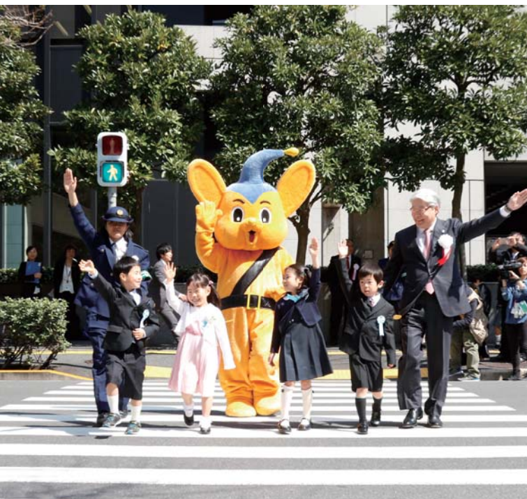
Road safety lessons