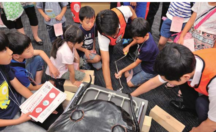
Experienced-based workshop, provided in partnership with NPO Plus Arts Upper: First-aid in emergency workshop Lower: Jack-up game