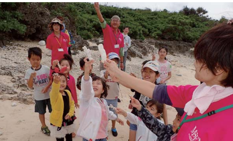
Upper: Nature conservation event in Hachirogata, Akita Lower: Searching coral reef in Okinawa