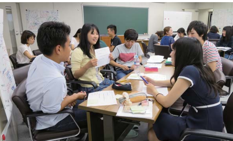
Upper: Public Seminars on the Environment, an outdoor class to experience nature through eating Lower: CSO Learning Scholarship Program: Training session

Giving back to community through puppet shows