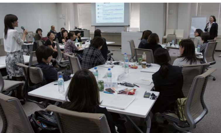
Upper: Childcare Leave Forum Lower: Pan-industry social event