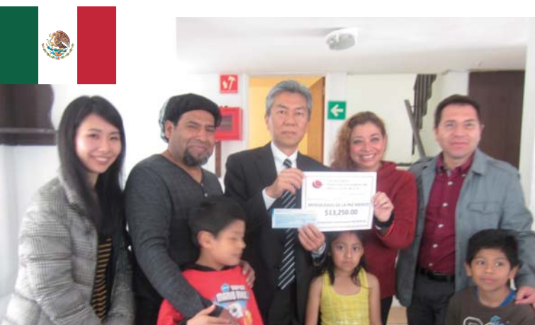
Upper: Repairing activity in Japanese school (South Africa) Lower: Donation to caring house (Mexico)