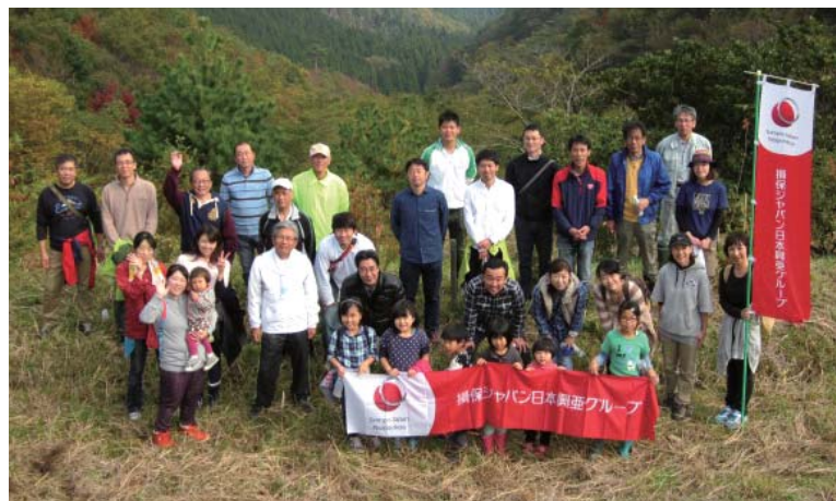
Upper: Activities in the Akagi forest in Gunma Lower: Activities in the Tottori Kyosei no Mori forest