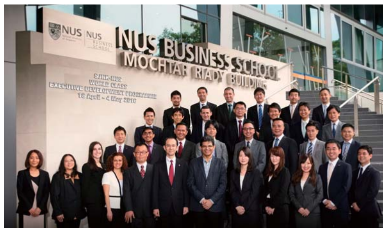
Upper: Holding annual Global Diversity Meeting to promote communication within employees Lower: SOMPO Global University program provided in cooperation with the National University of Singapore's Business School