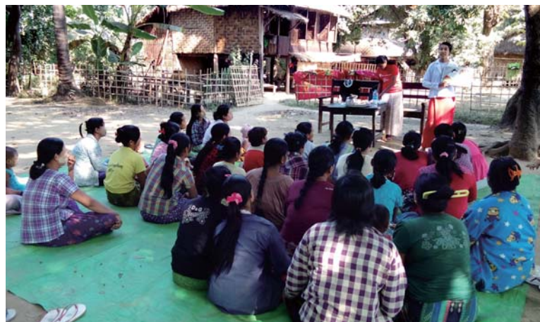
Upper: Trained midwives and midwife assistants Lower: Visitation of health center by citizens