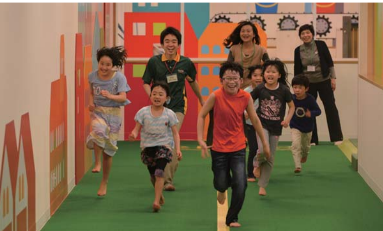
Upper: Donating to promote barrier-free access to rural market in Thailand Lower: Operation support for parks and healthcare of children in Fukushima, Japan

Museum of arts exhibiting Van Gogh's Sunflowers